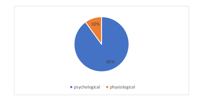
Figure 1. The Influence of Psychological Factors on Athletes' Performance

Based on Figure 1 . according to athletes and coaches, 90% of psychological factors affect the performance of athletes in matches, and physiological factors influence 10%.