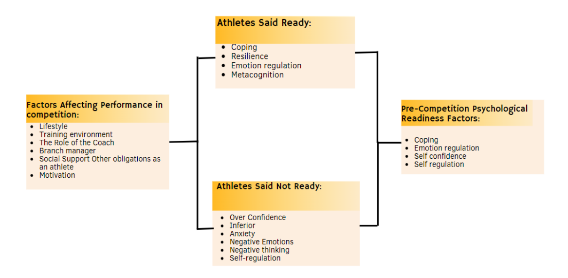
Figure 2. Psychological Readiness of Athletes Before Competing According to Coaches and Athletes

ISSN : 2477-3379 (Online) ISSN : 2548-7833 (Print)