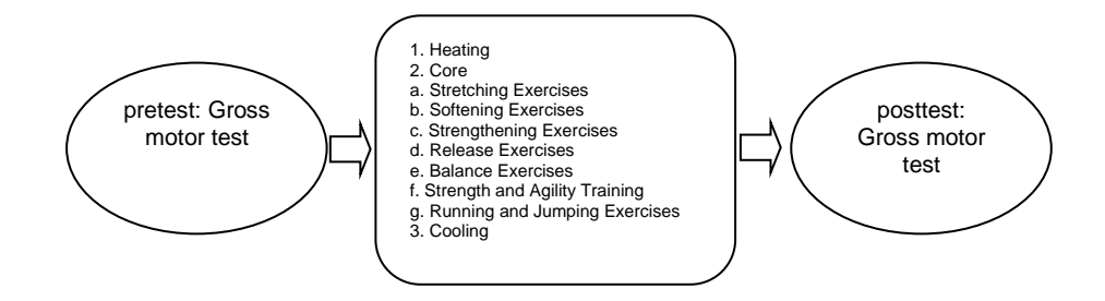
Figure 1. Experimental Design

Furthermore, si Buyung's gymnastics learning method in this study was adopted from previous research (Pradipta & Sukoco, 2013), which was used as a treatment of 14 meetings including with pretes and postes held at Asy Syaffa Kindergarten with Covid-19 Health Program. The research design is as follows: