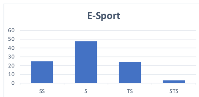
Figure 1. Bar Chart of Respondents' Outcomes

Calculation of data using a questionnaire and the score obtained was carried out to determine the number of gradations for each question item that had the answers to strongly agree, agree, disagree, and strongly disagree. To make it easier to see the percentage of acquisition of each answer to the questionnaire questions, categorize strongly agree, agree, disagree, and strongly disagree can be seen in Figure 1 below: