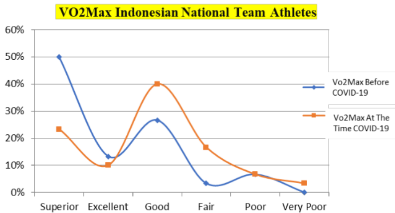
Figure 3. Histogram of VO2Max Percentage of Indonesian National Team Athletes

Based on table 5 above shows the results of the analysis which have been classified from the highest to the lowest. In the category with the superior classification obtained 7 (23.33%) athletes, then in the excellent classification obtained 3 (10%) athletes, then in the category with the good classification 12 (40%) athletes, on the fair 5 classification (16.67%) athletes, in the classification of poor 2 (6.67%) athletes, and in the classification of very poor 1 (3.33%) athlete. When viewed from the level of the vo2max category before the covid-19 pandemic and during the covid-19 pandemic the subjects can be classified, namely: