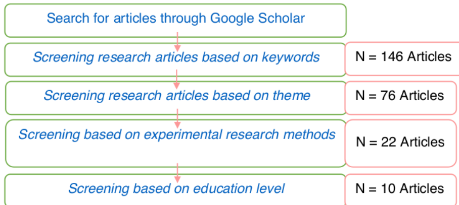
Figure 1. Research article screening chart

( https://scholar.google.co.id/ ). The stages of screening (screening) research articles are described as follows.