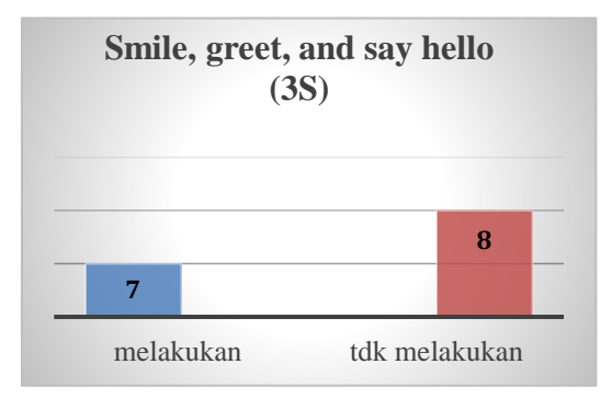
Diagram 6. Smile, Greet, and Greet (3S)

diagram 6. There are 7 students who behave in 3S (smiles, greetings, greetings), and 8 students who do not.