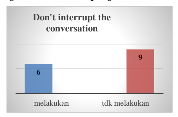
Diagram 4. Not Interrupting the Conversation

In diagram 4. there are 6 students who do not interrupt talk), and 9 students who don't do (still often interrupt talk).