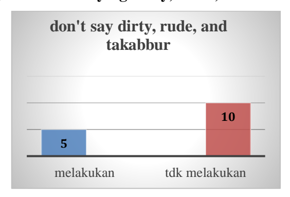
Diagram 2. Not Saying Dirty, Rude, and Takabbur

In diagram 2. There are 5 students who do not say dirty, rude, or takabbur, and there are 10 students who often say dirty, rude or takabbur.