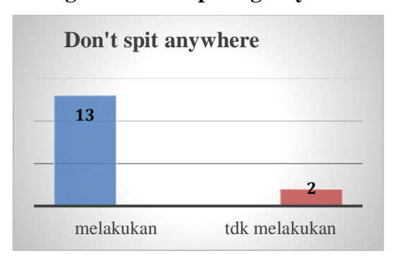
Diagram 3. Not Spitting Anywhere

In diagram 3. D found 13 students who did not spit anywhere, and found 2 students who still had the habit of spitting everywhere.