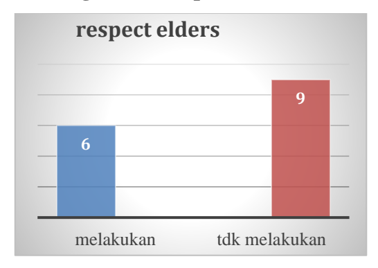
Diagram 1. Respect for Elders

In diagram 1. There are 6 students who respect their elders, and 9 students who do not.