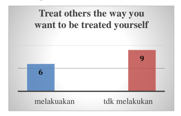
Diagram 8. Treating Others As You Would Like To Be Treated

In diagram 8. There are 6 students who treat others as they would like to be treated, and The other 9 students are less fully in behaving as they want to be treated.