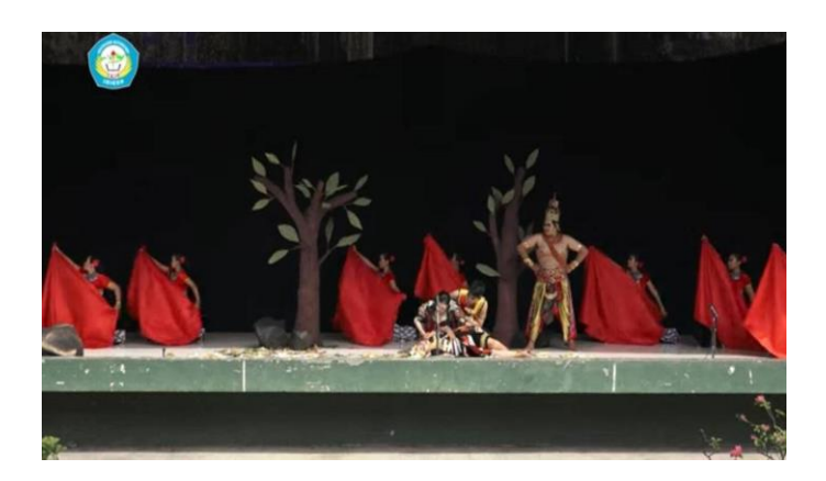
Figure 3. Drama Staging of Calon Arang