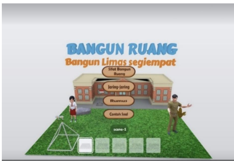
Figure 2. Pre-design of Learning Media Product

Researchers used the Assembly Edu and Microsoft Word applications to design the concept of a number card product applied to the augmented reality platform. Assemblr Edu is an Augmented Reality platform explicitly used for educational purposes with 3D and Augmented Reality technology. This platform facilitates the learning process by creating interactive learning media. Microsoft Word is a word-processing application for creating, editing, and formatting data in text or writing. Microsoft Word is used to design the contents of the mathematical geometric shape card according to the desired format, such as text, giving attractive colours, text boxes, image illustrations and also evaluation questions.