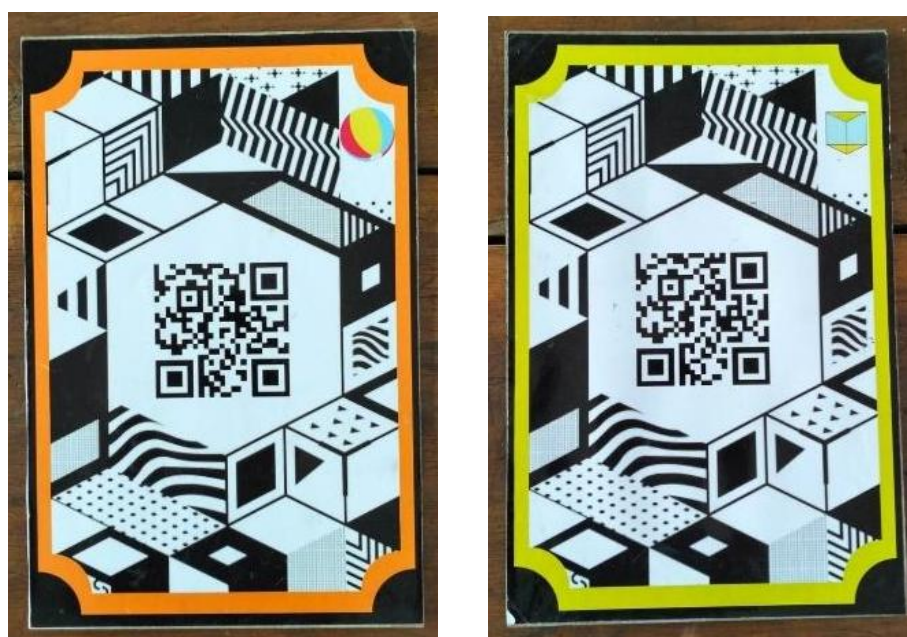
Figure 4. The finished Mathematics Cards

After the barcode is obtained, the barcode image is downloaded, printed using photo paper, and attached to the cardboard that has been provided. An example of the printed barcode can be seen in Figure 4.