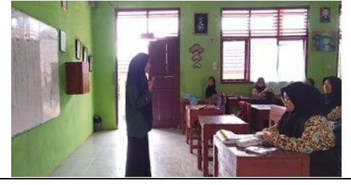
Students are assisted by the teacher to conclude the results of the discussion together

Mathematical representation skills are of paramount importance for students engaging with mathematics. These skills facilitate students' comprehension of complex concepts and empower them to articulate ideas using a variety of representations such as symbols, graphs, images, tables, written text, and mathematical expressions. Such multi-faceted fluency in representation is essential for a robust understanding of mathematical principles and for communicating intricate mathematical ideas effectively.