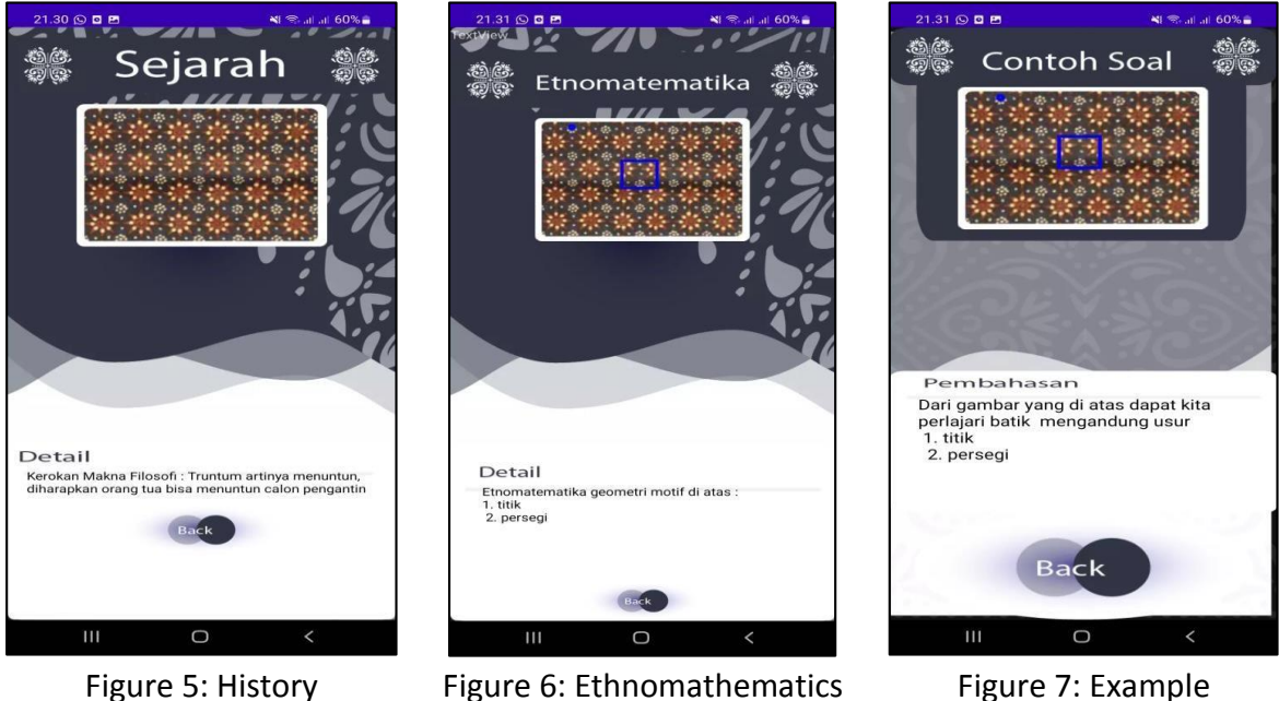
Figure 6: Ethnomathematics

As seen in Figures 2, 3, and 4 are one of the main views related to the application being developed considering that this research was carried out in 3 provinces, namely West Java, Central Java, and East Java. So in the main view in Figure 2, you can see the area selection. Figure 3 is selected for the province of West Java, and a list of batik motifs in West Java will appear. Figure 4 shows one of the batik motifs in West Java from Cirebon, namely the Mega Mendung motif.