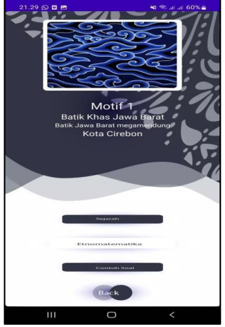
Figure 4: Mega mendung batik motif

As seen in Figures 2, 3, and 4 are one of the main views related to the application being developed considering that this research was carried out in 3 provinces, namely West Java, Central Java, and East Java. So in the main view in Figure 2, you can see the area selection. Figure 3 is selected for the province of West Java, and a list of batik motifs in West Java will appear. Figure 4 shows one of the batik motifs in West Java from Cirebon, namely the Mega Mendung motif.