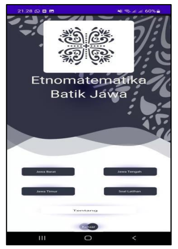
Figure 2: Home

The results of developing an Android-based ethnobatic application can be seen in the following pictures: