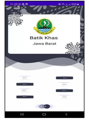
Figure 3: List of batik motifs