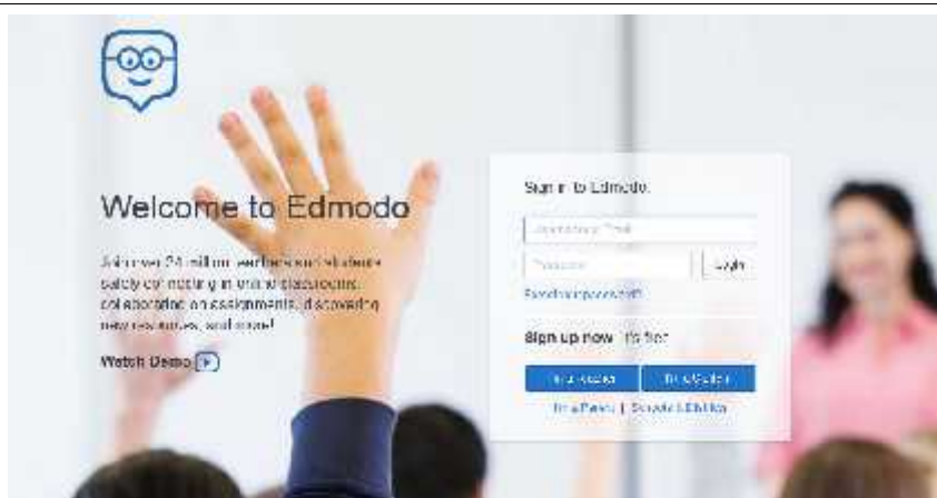
Picture2: The Login page and registration form of Edmodo

User interface for teacher and students is different; the different is on the administration box in the left side of the model it is also indicate that students and teacher has a different privilege to manage the site. Setting box for the teacher is use to manage the whole course handling by each of the teacher (See picture 3). Adding the course and manage the resources teacher just push the button in the administration site box. For adding a resources teacher need to put a drop down menu in the right side of the site.