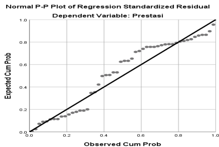
Figure 1. Normality Test

The normality test results are carried out by looking at the Normal Probability Plot graph, which can be seen in the following figure.